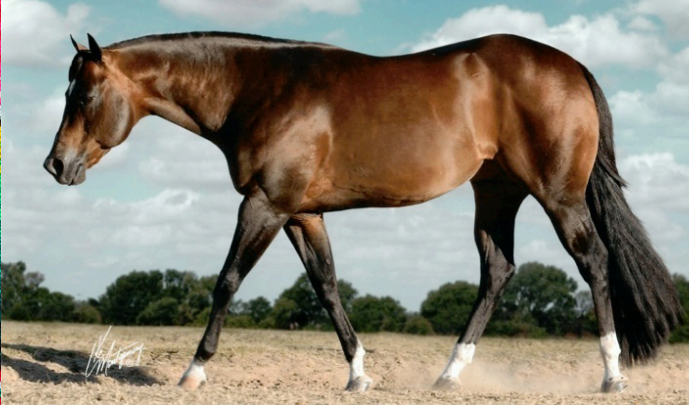
Zips Chocolate Chip

"Throughout his show career, Chip earned $59,443 along with 81 Western Pleasure points."